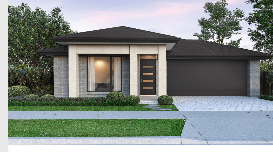
□ 3 □ 1 ← 2 ← 1

House Size 137m<sup>2</sup> / 14.83sqs Width 7.50m