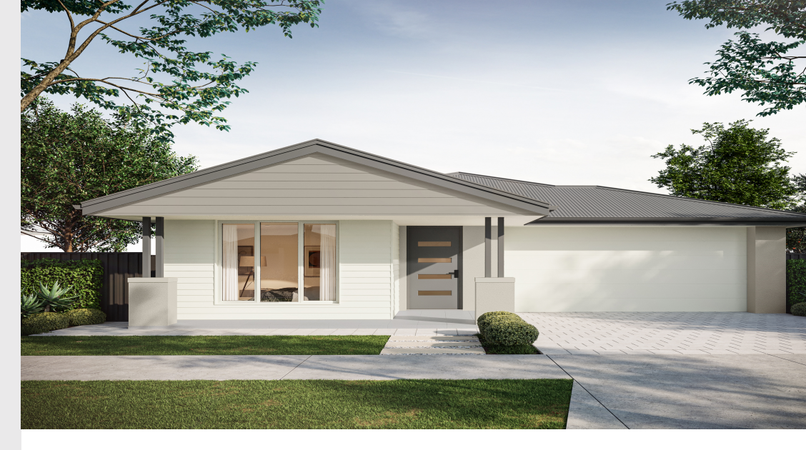
□ 4 □ 2 □ 2 □ 2 □ 2